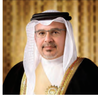
HRH Prince Salman

international forums, including the United Nations Security Council, and underscores the Kingdom's role as a reliable partner in global efforts to promote peace and security.