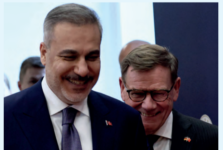
Turkey's Foreign Minister Hakan Fidan (L) and Germany's Foreign Minister Johann Wadepuhl attend a joint press conference following their meeting in Ankara

Fidan also called for an end to Israel's bombardment of Lebanon, saying it had forced the displacement of "nearly a million