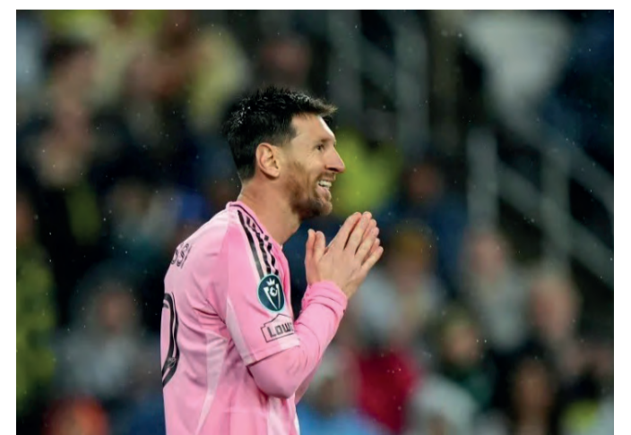
Argentine superstar Lionel Messi of Inter Miami reacts after a missed shot