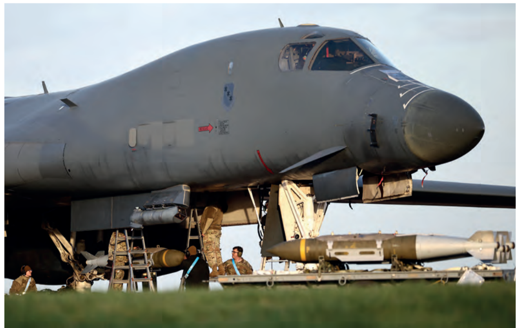
USAF military ground personnel load Joint Direct Attack Munitions (JDAM) into a US Air Force (USAF) B-1 Lancer bomber on the tarmac at RAF Fairford in south-west England

The Center for Strategic and International Studies (CSIS) independent think tank in Wash-