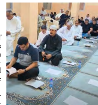
Praying for peace and protection for the Kingdom and its people

Families arrive together, while others come quietly on their own, seeking moments of reflection away from daily noise.