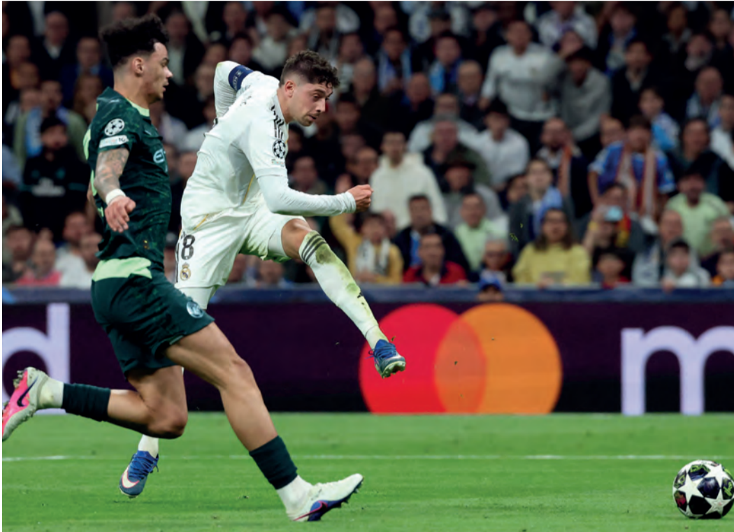
Real Madrid's Uruguayan midfielder #08 Federico Valverde scores his second goal

Valverde ran onto a long kick from Thibaut Courtois and dribbled past Gianluigi Donnarumma to slot home and give Madrid the lead at the Santiago Bern-