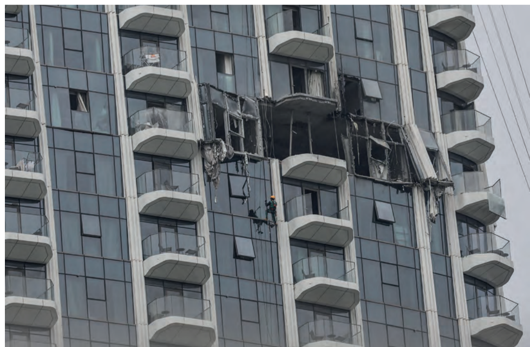
A stepplejack assesses the damage after a building was hit by a reported drone strike in Dubai's Creek Harbour

in the face of US and Israeli aggression, brutalities and atrocities amounts to nothing less than complicity," Esmail Baqaei said in a post on X.