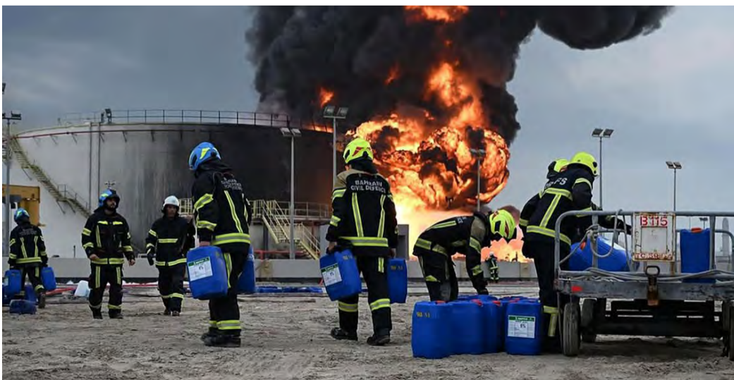
Civil defense teams successfully contained a fire at a fuel tank facility in Muharraq Governorate following an Iranian attack yesterday morning. The Ministry of Interior had initially urged residents in Al-Hidd, Arad, Qalali, and Samaheej to stay indoors and close windows and vents as a precaution. After completing cooling and safety measures, authorities confirmed it was safe for residents to resume normal activities and thanked them for their cooperation.