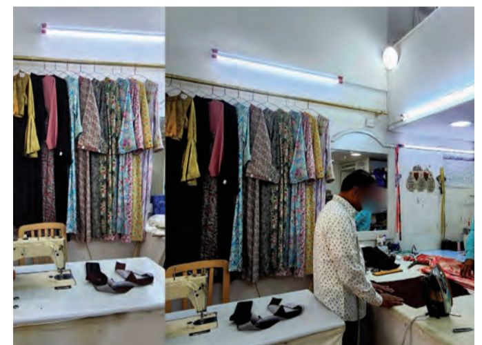
This Ramadan brings a quiet afternoon for a local tailor