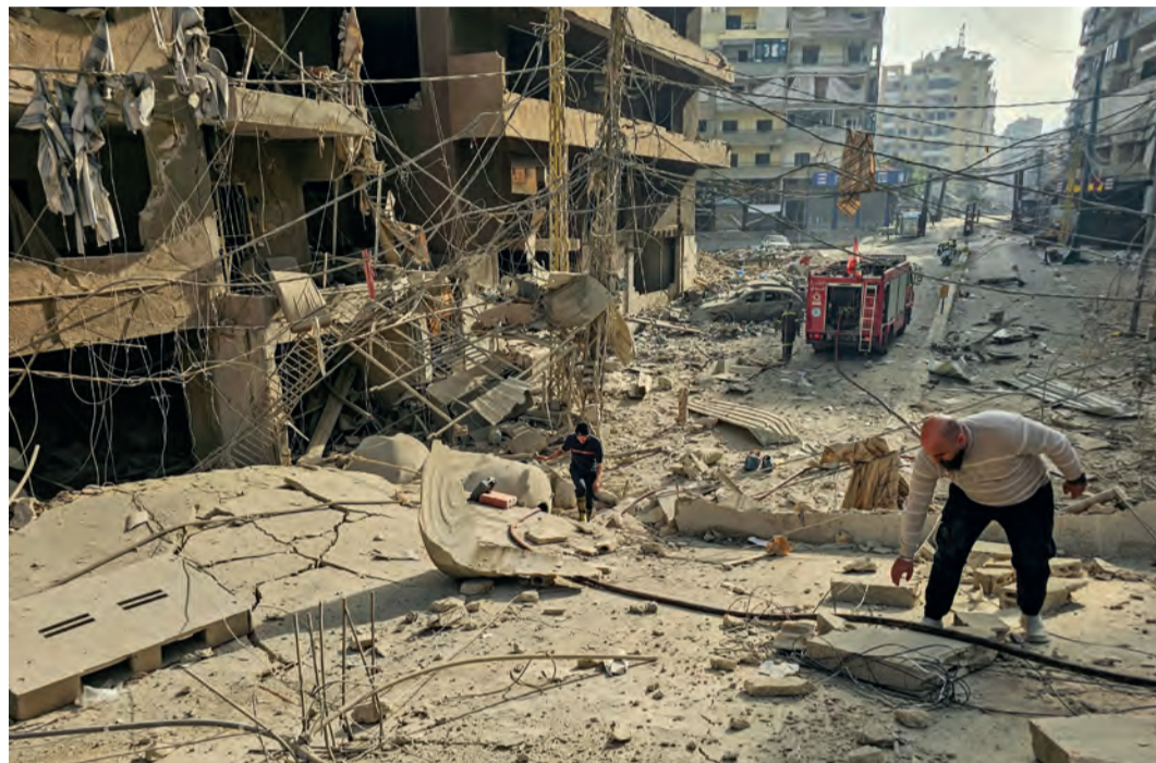
A man stands on the rubble of a destroyed building as firefighters work at the site of overnight Israeli airstrikes in the Haret Hreik neighbourhood of Beirut's southern suburbs

"I warned the President of Lebanon that if the Lebanese government does not know how to control the territory and prevent Hezbollah from threatening northern communities and firing toward Israel -- we will take the territory and do it ourselves," Katz said.