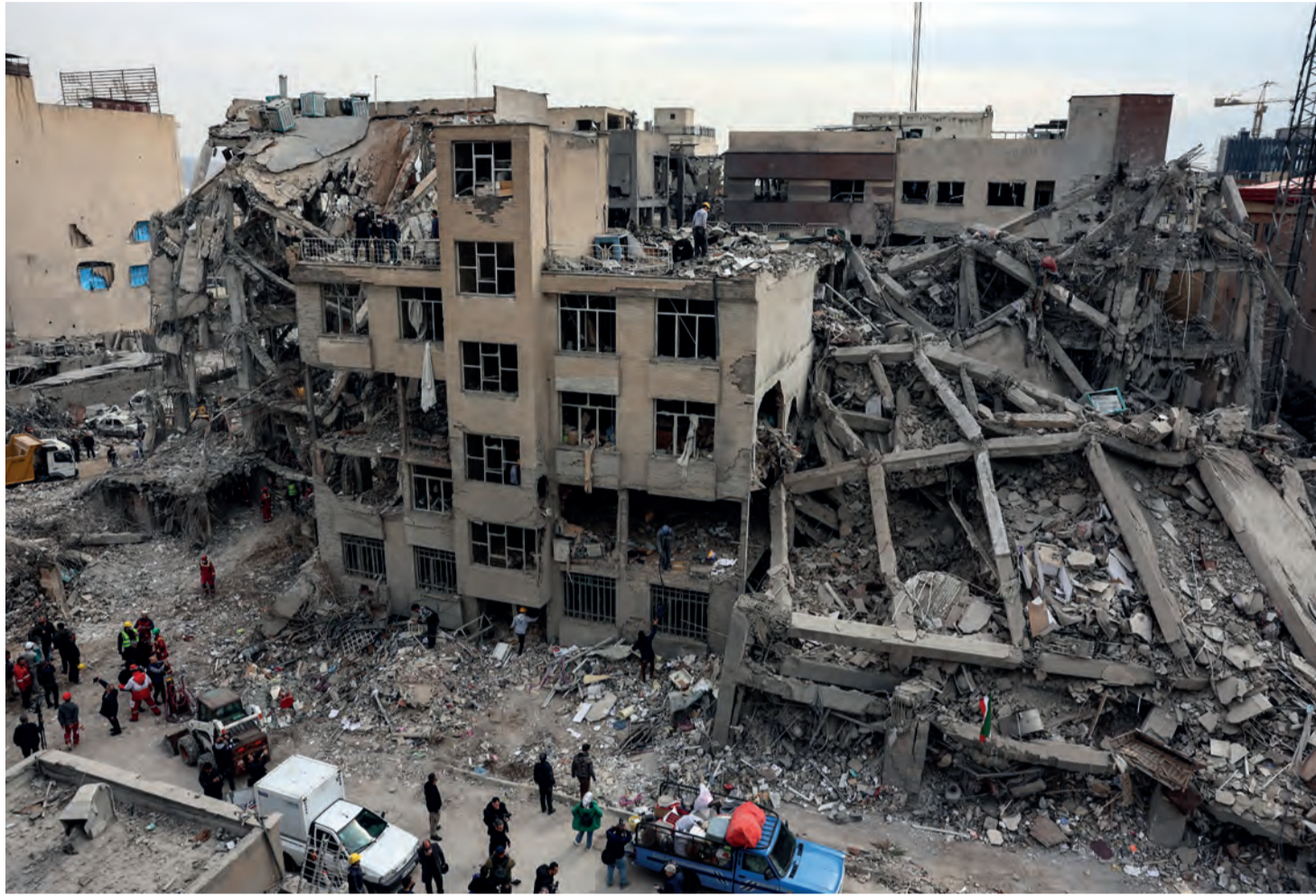
Rescue workers gather outside a damaged residential building as residents collect belongings from the rubble in Tehran

Under attack from Iran, shipping in and around Hormuz has