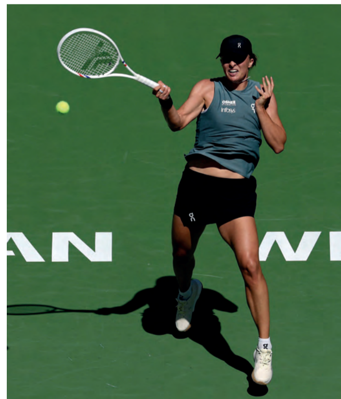
Iga Swiatek of Poland returns a shot to Karolina Muchova of Czechia

"For me, it's a little bit more time to recover for tomorrow's big match," said the 31-year-old who has lost four of five prior encounters with Swiatek.