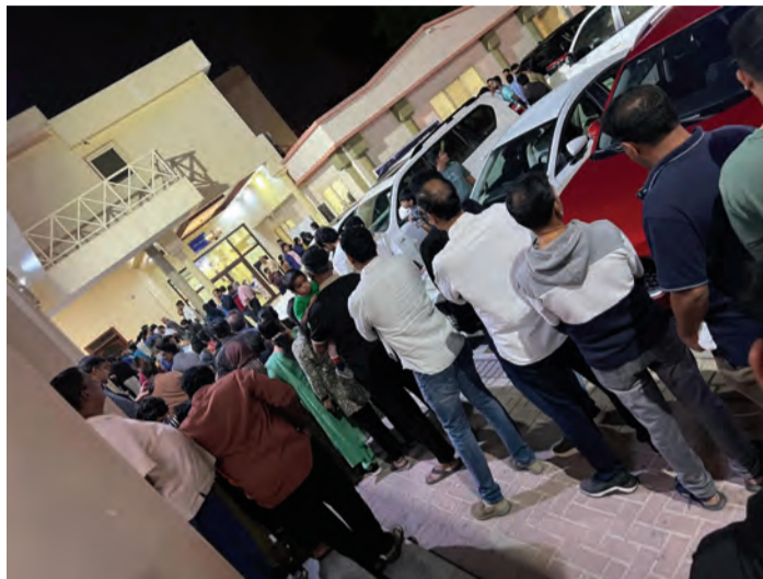
BKS, Segaya sees heavy turnout