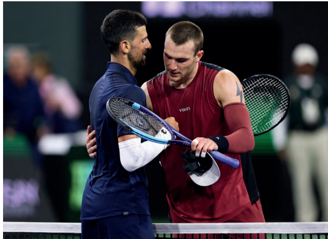
Jack Draper of Great Britain shakes hands at the net after his three set victory against Novak Djokovic of Serbia

The margins were razor-thin over the first two sets. The tide turned on an epic point in the opening game of the third that saw both players chasing down drop shots and scrambling for