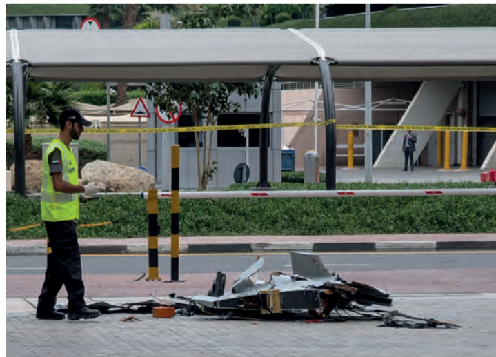
A policeman inspects the wreckage of a drone in downtown Dubai