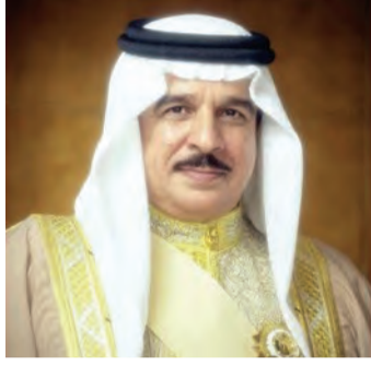
HM the King

The Minister noted that the achievement strengthens Bahrain's diplomatic presence in