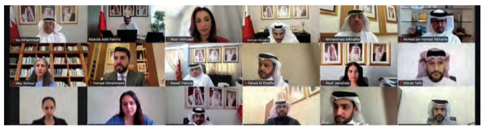
His Royal Highness Prince Salman bin Hamad Al Khalifa, the Crown Prince and Prime Minister, remotely chaired the 520th Government Executive Committee meeting. Plans implemented to address the impact of the hostile Iranian aggression towards the Kingdom of Bahrain, and initiatives to develop labour market procedures were reviewed.