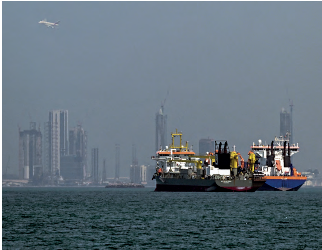
Commercial vessels are pictured offshore in Dubai

On Tuesday, Wright sent oil prices see-sawing when he said US ships had carried out an escort, before his social media post was swiftly deleted and the White House denied that such an operation had occurred.