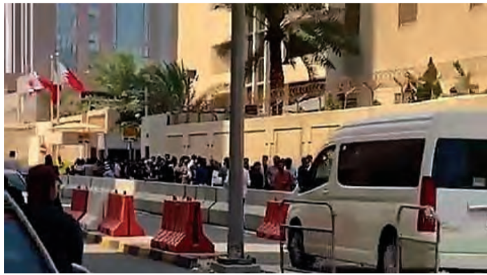
Indian residents line up at Saudi embassy

and the elderly are being given priority. Dammam to Mumbai flight priced at BD 280 is planned for March 16.