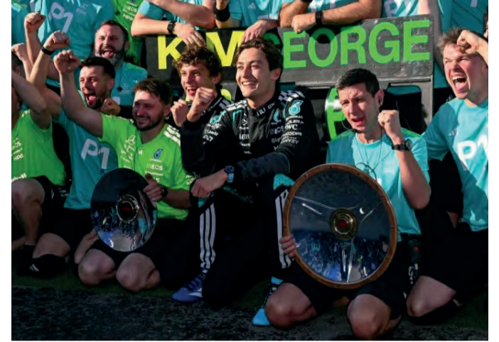
George Russell (centre R) and Kimi Antonelli celebrate in Melbourne