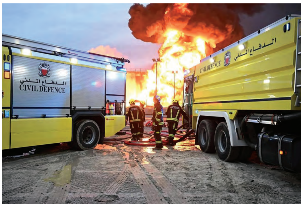
Civil defence teams successfully extinguished a fire at a fuel tank facility in Muharraq hit by an Iranian attack yesterday morning

part of an unacceptable course of escalation and hostile conduct aimed at destabilising the region.